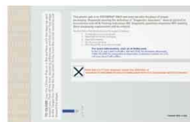
Small Clinical Pak (Back View)

Shipments marked or labeled 6.2 (infectious materials) and/or containing dry ice cannot be shipped inside the FedEx Clinical Pak. For more information on shipping infectious substances, call FedEx Customer Service.