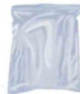
Sealed Plastic Bag