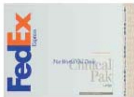
Large Clinical Pak (Front View)

FedEx provides a plastic FedEx Clinical Pak for clinical samples, Diagnostic Specimens and environmental test samples with outer packaging sizes under 18cm x 10cm x 5cm (7" x 4" x 2"). The small clinical pak (inventory No. 150948) measures 35cm x 23cm (14" x 9") and is suitable for shipping single and smaller-sized test specimens. The large clinical pak (inventory No. 135629) measures 48cm x 35cm (19" x 14") and is more appropriate for multiple and larger specimen shipments. Any individual specimen packages placed in the FedEx Clinical Pak must meet the four basic packaging requirements (watertight primary receptacle, watertight secondary receptacle, absorbent material and sturdy outer packaging).