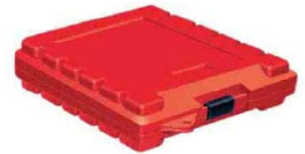
Rigid Plastic Container