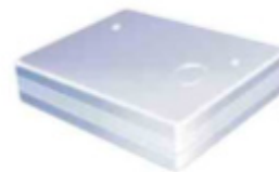
Sealed Styrofoam® Container (1-inch-thick minimum)

For Diagnostic Specimens, enclose an itemized list of contents between the secondary packaging and the outer packaging. For solids, the secondary packaging must be siftproof. These illustrations below are not intended to represent secondary containers for Diagnostic Specimens. Secondary containers for Diagnostic Specimens must be certified by the manufacturer prior to use.