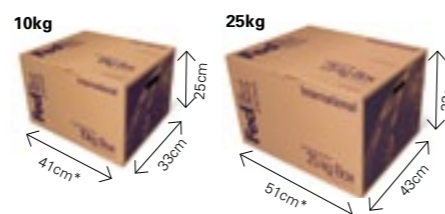
Dangerous goods are not accepted in FedEx packaging.

FedEx® 10kg and 25kg Box: an express delivery service for any shipments up to 10kg or 25kg, at a competitive, fixed price. FedEx® 10kg and 25kg Box cannot be used when shipping FedEx International Economy®.