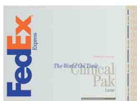
Large Clinical Pak (Front View)

FedEx provides a plastic FedEx Clinical Pak for clinical samples, Biological Substance Category B (UN3373) and environmental test samples with outer packaging sizes under 18cm x 10cm x 5cm (7" x 4" x 2"). The small clinical pak (inventory No. 150948) measures 31cm x 24cm (12 1/4" x 9 1/2") and is suitable for shipping single and smaller-sized test specimens. The large clinical pak (inventory No. 135629) measures 41cm x 33cm (16" x 12 7/8") and is more appropriate for multiple and larger specimen shipments. Any individual specimen packages placed in the FedEx Clinical Pak must meet the four basic packaging requirements (watertight primary receptacle, watertight secondary receptacle, absorbent material and sturdy outer packaging).