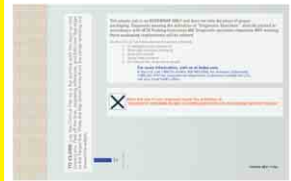
Small Clinical Pak (Back View)

If you are using the FedEx Clinical Pak to ship Biological Substance Category B (UN3373), you must check the applicable box on the back of the FedEx Clinical Pak.