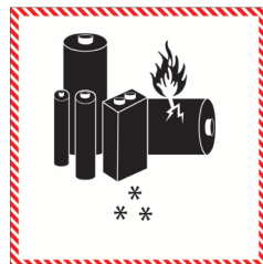
Lithium Battery Mark