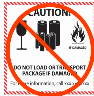
Lithium Battery Label

The Lithium Battery Class 9 hazard label must be used instead.