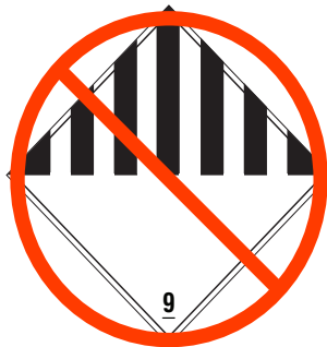
Class 9 Miscellaneous Dangerous Goods Hazard Label

The Class 9 label cannot be used as the hazard label for Section I/IA/IB shipments effective 01/01/19.