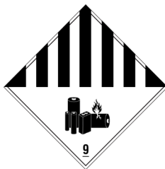
Lithium Battery Class 9 Hazard Label

NOTE: No text other than the Class "9" must be included in the bottom part of the Lithium Battery Class 9 label. IATA 7.2.2.4