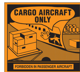
Cargo Aircraft Only Label