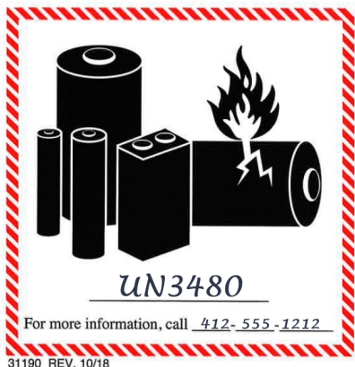
Battery handling mark